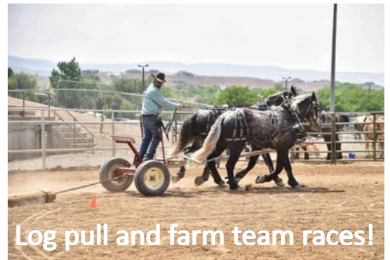
Log pull and farm team races!

“These materials are neither sponsored nor endorsed by Washington County School District. Washington County School District Foundation has received direct financial benefit for distribution of this flyer.”